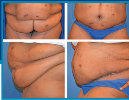
PANNICULECTOMY Before | After