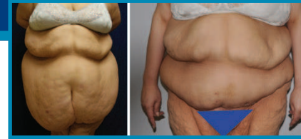
Before | After

The difference between a panniculectomy and an abdominoplasty (tummy tuck) can be confusing to patients. It is understandable because the two procedures have some aspects in common but they are not the same . This distinction has become even more relevant because of the growing popularity of weight loss surgery.