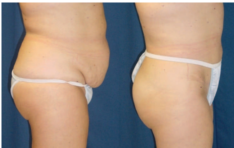
TUMMY TUCK Before | After

"Abdominoplasty or Tummy Tuck is a cosmetic procedure."