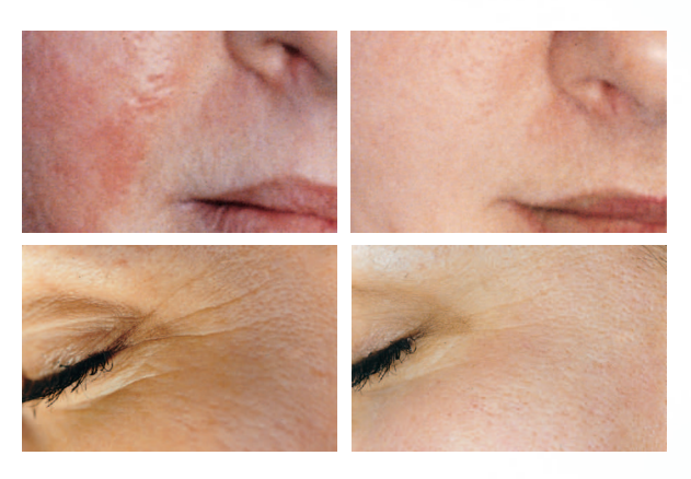
before and after photos