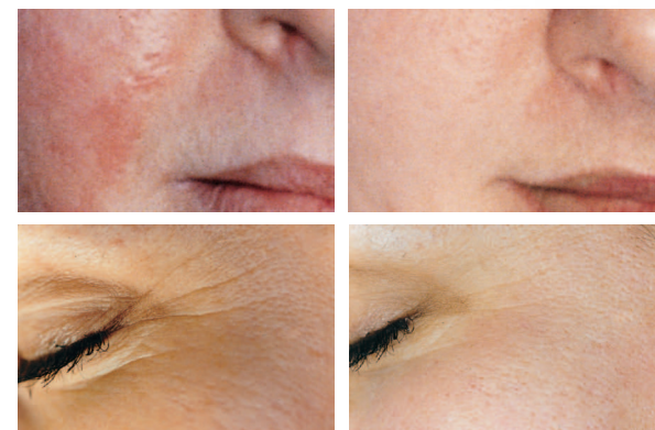
before and after photos